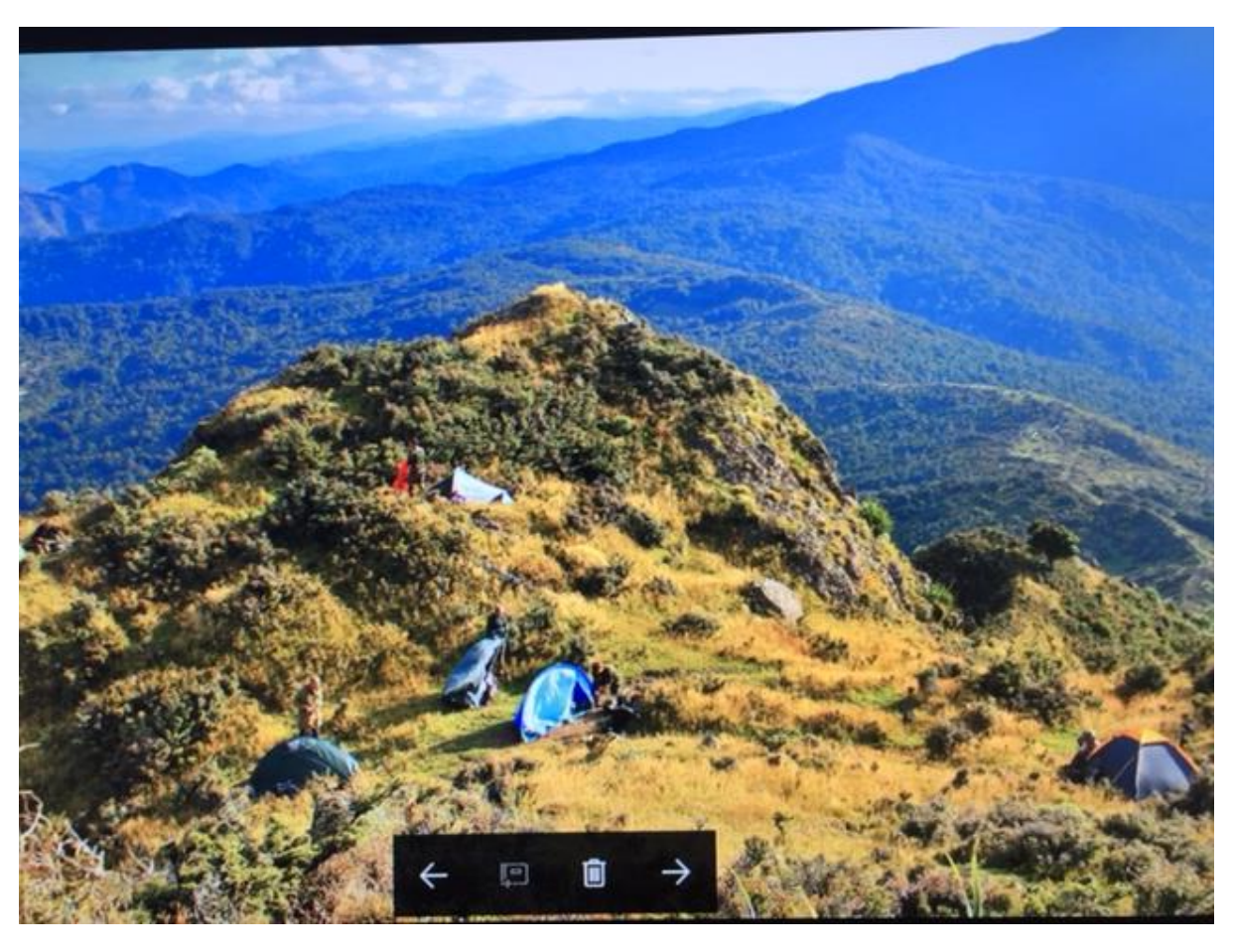
Not taken during SAREX