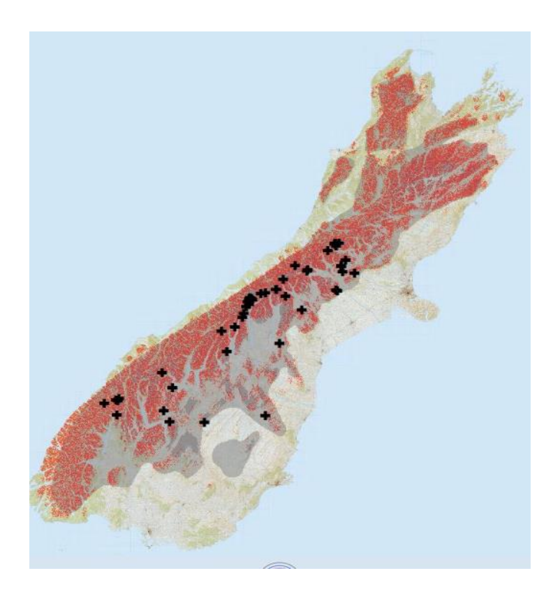
Figure 6: South Island avalanche terrain and recorded fatalities