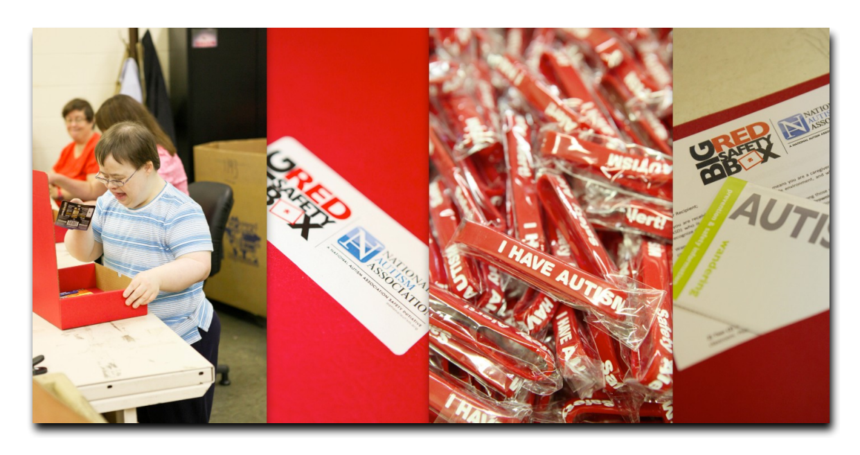
NAA's Big Red Safety Box initiative ships critical resources to at--- risk children and adults with autism. The initiative also helps provide employment for adults with autism and other disabilities.

For more information on autism--- related wandering, please visit <u>awaare.org</u>. For specific questions, please contact the National Autism Association at 877--- 622--- 2884, or 877--- NAA--- AUTISM.