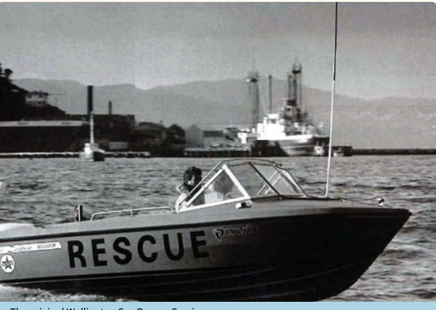
The original Wellington Sea Rescue Service

"Knowledge would be passed on within a Coastguard unit, but no further. Training wasn't standardised as it is today." – Ian Coard, Riverton Coastguard