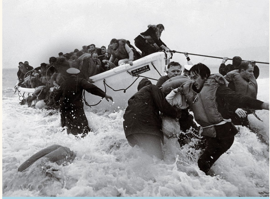
Helping survivors on board one of four life boats from the stricken Wahine, 1968

"With the launch of the Nowcasting service in the 90s, we are providing boaties with an accurate picture of current conditions in their intended spot, before they head out," he says. "We've generally become a lot more safety conscious – from TracPlus keeping tabs on where our vessels are, down to the design of the vessels themselves – until recent years, for example, there were no open cabins to get out of the weather."