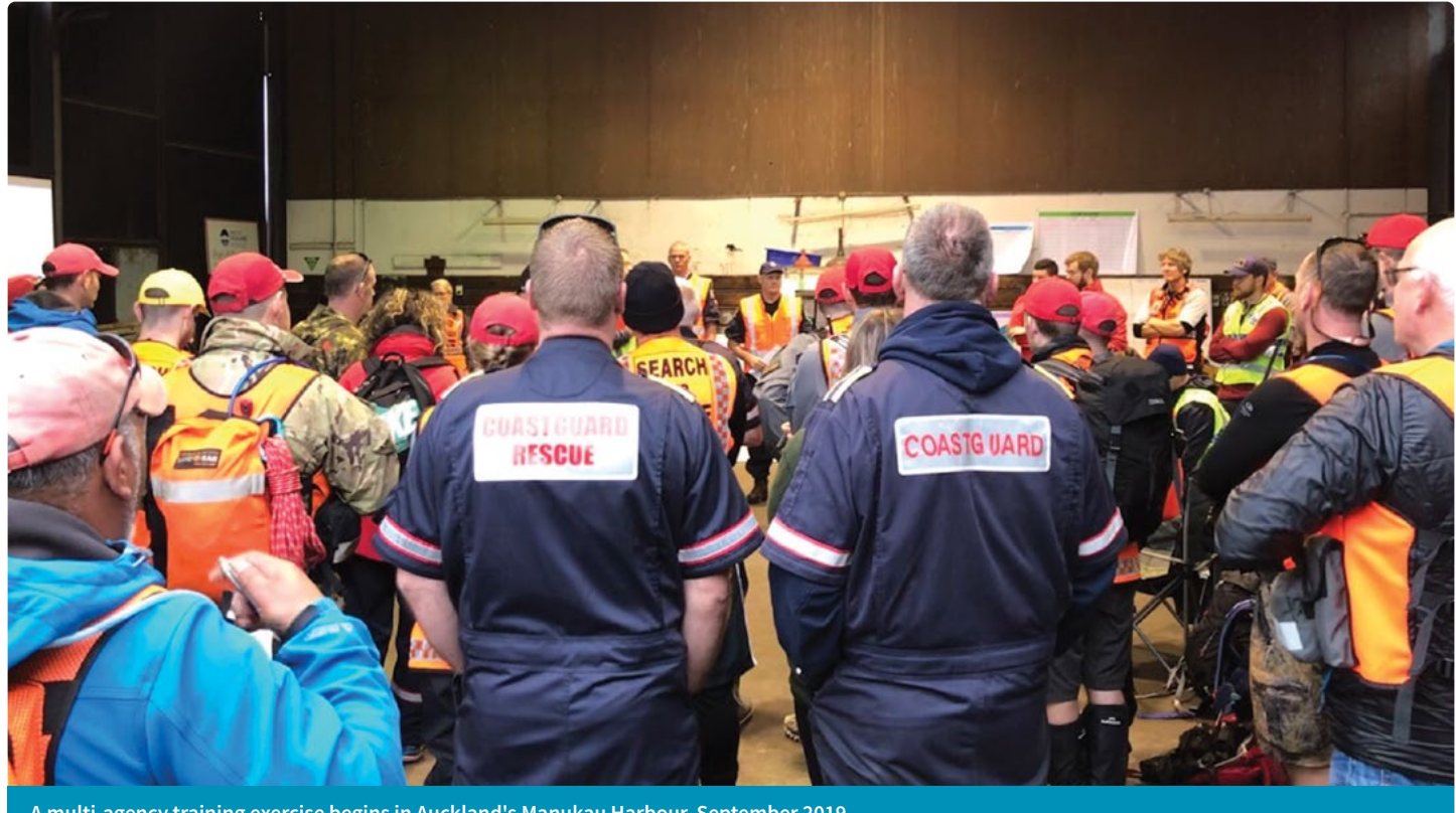
A multi-agency training exercise begins in Auckland's Manukau Harbour, September 2019