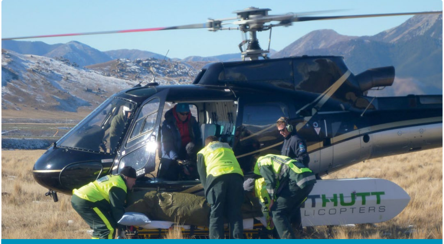
Preparing to airlift a critical patient as part of a Search and Rescue Exercise (SAREX), Canterbury 2018