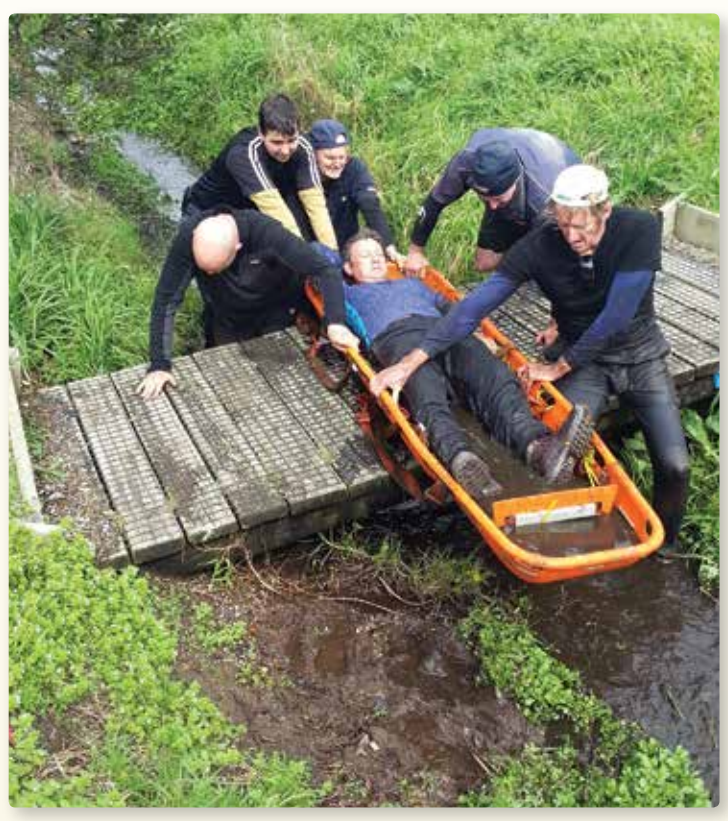
SAR Leadership Course

"It removed our comfort factor that comes with familiarity. I was put in a high pressure situation where I didn't know the terrain, the people, their skill sets or abilities, and I had to lead my way through that. This is what can happen in large or multi-day operations. I ended with a better understanding of other organisations, how they work, and how we integrate with each other."