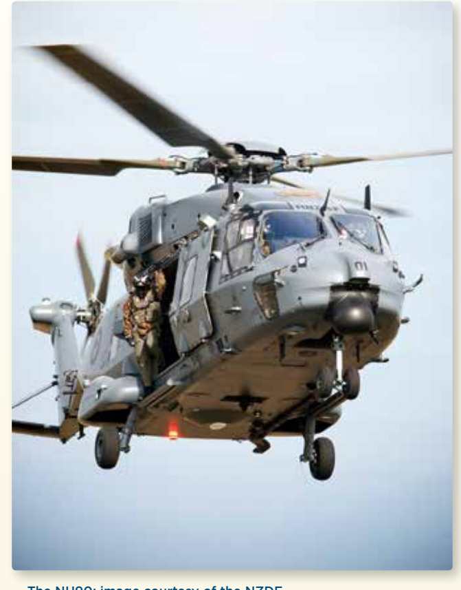
The NH90: image courtesy of the NZDF

But a SAROP is only one of the many roles that the NZDF performs; its people are multi-disciplined and trained to carry out a wide range of operations. The NZDF is significantly smaller than a lot of other military forces and, therefore, it operates differently. To that end, it uses its assets for a wider range of roles than other nations. It would not be cost effective for New Zealand to mount substantial United States modelled Coastguard and Customs forces, so the NZDF