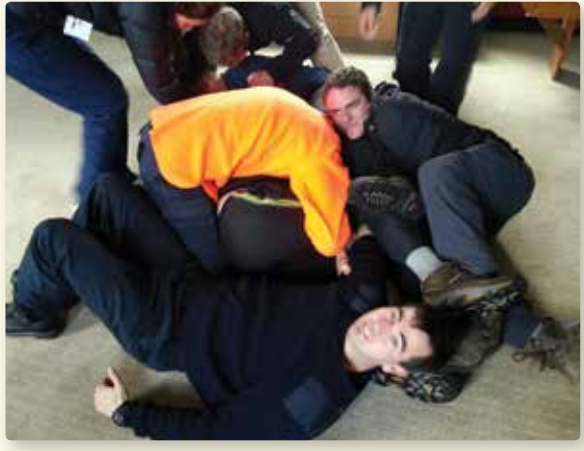
SAR Leadership Course

Tai Poutini Polytechnic run the three-day course which is designed to provide existing and aspiring team leaders and managers with the skills and knowledge to help lead small teams. This includes achieving critical tasks, often in remote and hazardous terrain. It combines theory sessions on leadership, group process, conflict resolution and feedback, with plenty of time to put it all into action in the field.