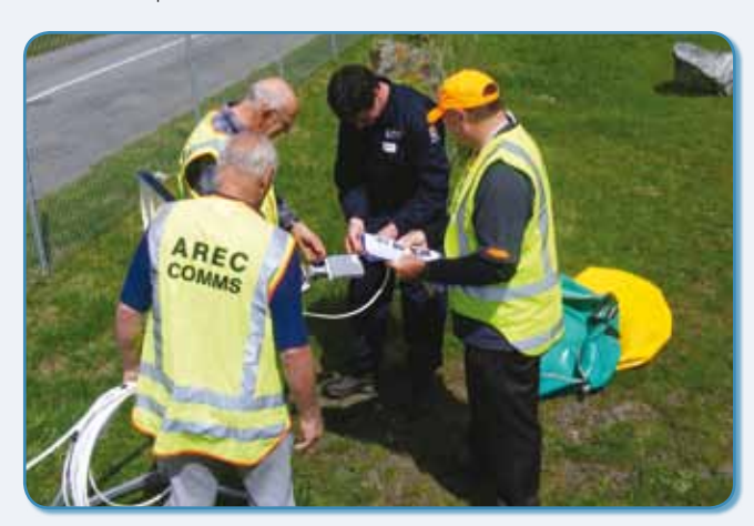
Communicators at work with Police and LandSAR staff.

organisations that were involved, and for his role in facilitating the workshop.